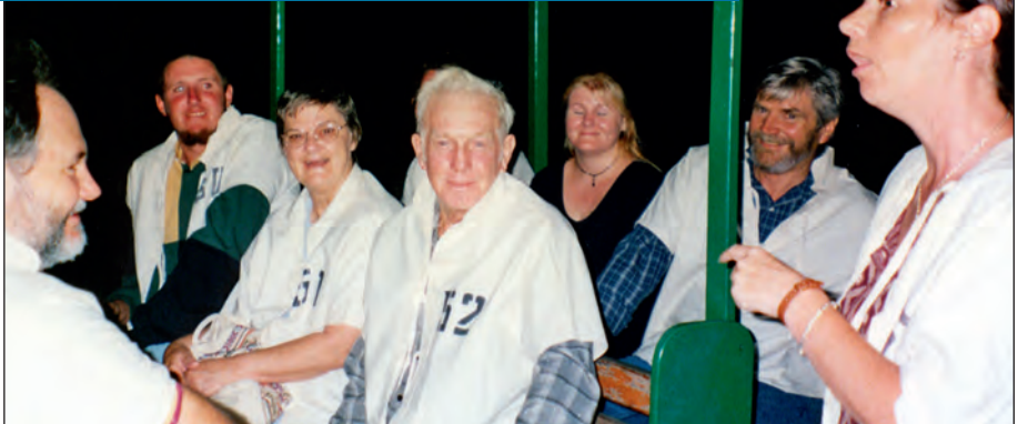
Hutchies' crew was under threat of being left behind if they didn't behave.

A good time was had by all and, happily, nobody was left behind.