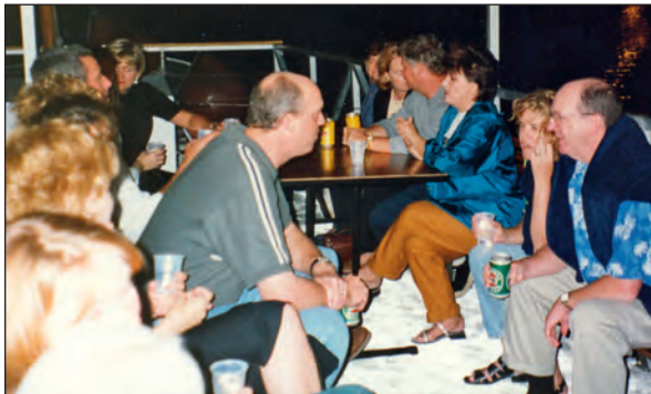
Members of the Social Club head for jail in style.

RIGHT: The female contingent of the Hutchies' Social Club chose to spend their weekend away visiting the Stanthorpe wineries.