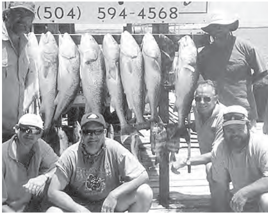
▲ Only kidding! This is a ring-in photo from a fishing trip by Hutchies' associated company, Kinco, in the USA. This haul came from a trip to the Gulf of Mexico. Seems the next Hutchies' fishing trip should be to USA or the Kinco team needs to come to Moreton to show how it's done.